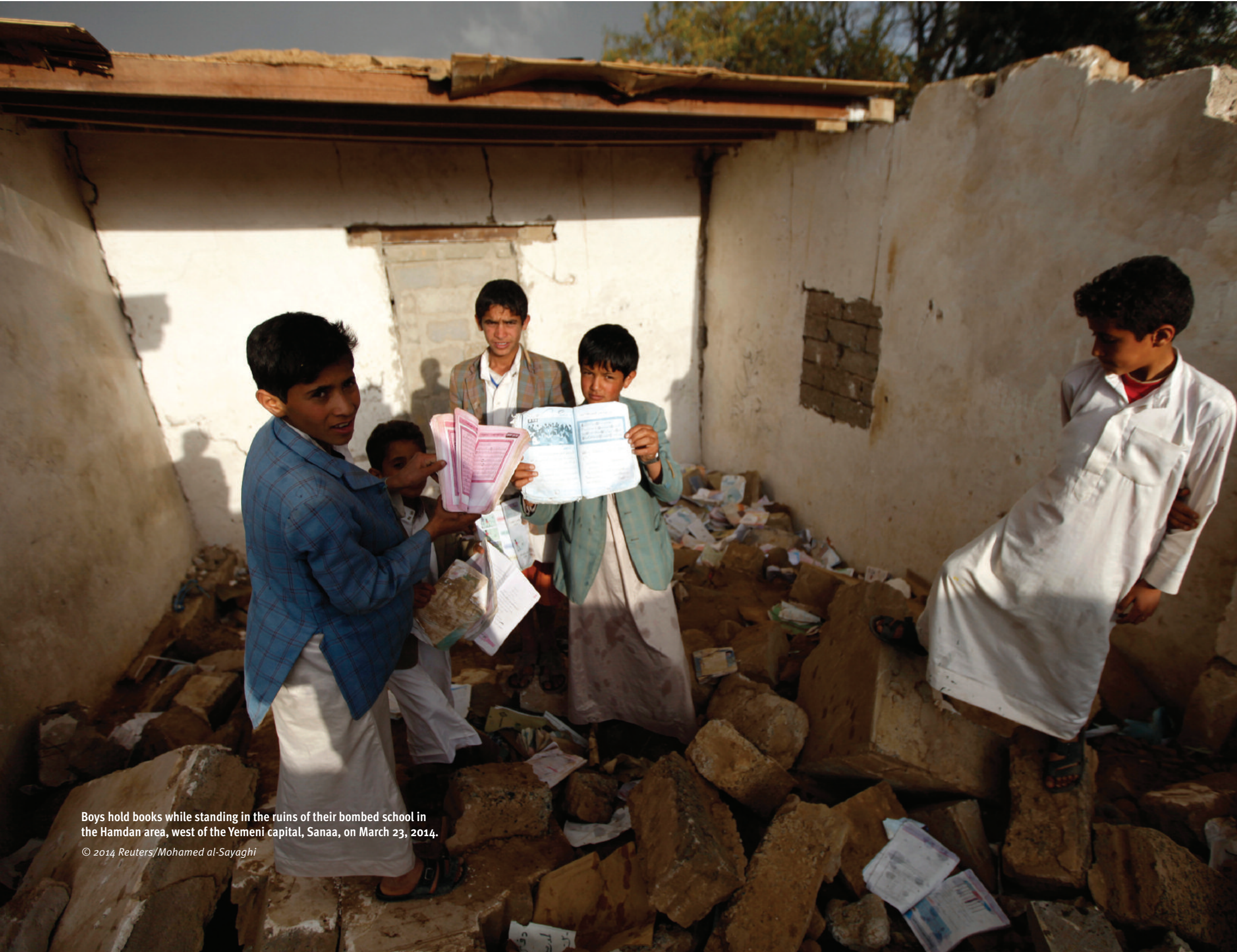
Boys hold books while standing in the ruins of their bombed school in the Hamdan area, west of the Yemeni capital, Sanaa, on March 23, 2014.