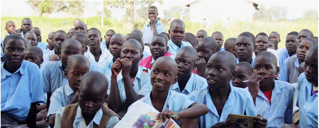
Adolescents in Nwoya District, Uganda, attend an outreach event conducted by Nwoya Youth Center on sexual and reproductive health