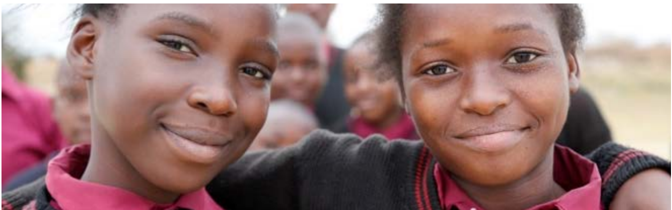
Educating girls helps break the cycle of poverty.