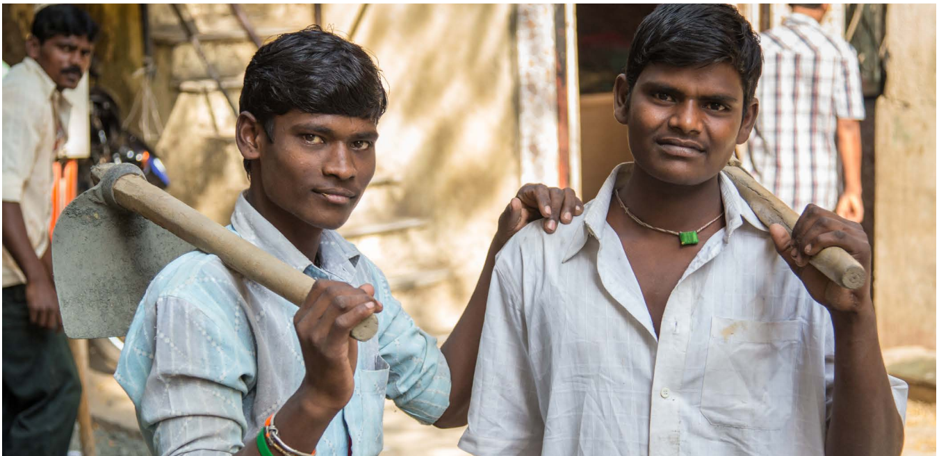
Mumbai, India - 08 January 2015: Two young Indian workers stand in street with hoes in hands. Young boys and girls work as cheap labor throughout India.

Poor mental health was assessed using questions across all six countries that focused on feeling lonely, worry that affected sleep, and suicide plans within the past 12 months. Using multiple logistic regression analyses,