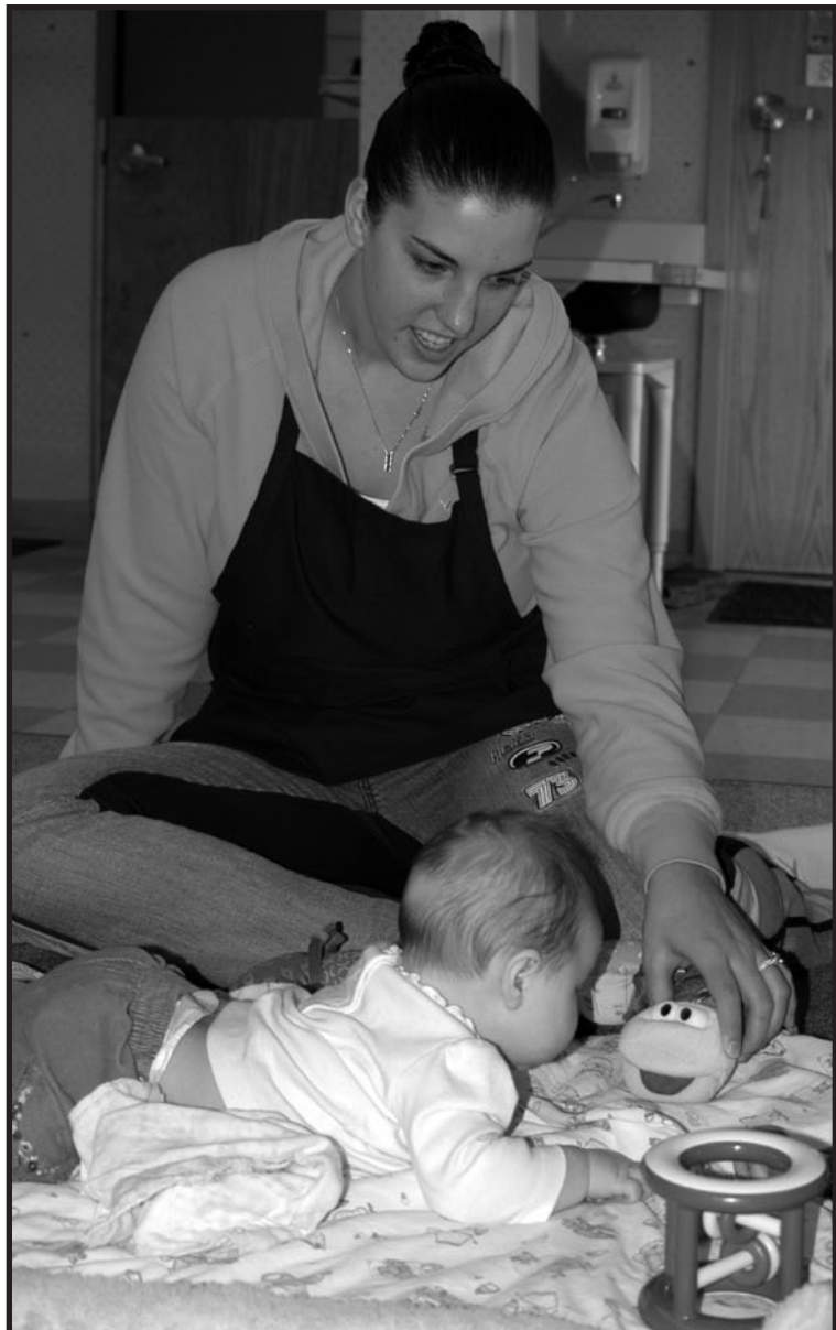
Subjects & Predicates

Family culture and ethnicity also influences children's perceptions of gender. The cultural biases of different ethnic groups may expose children to more deeply ingrained stereotypes than exist in the main-