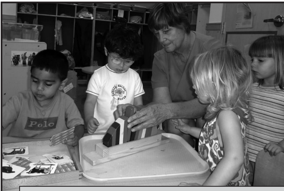
Subjects & Predicates

Skilled teachers encourage cross-gender activities and play in cross-gender centers. Positively reinforce children who are playing with non-stereotyped toys by talking with them and supporting their learning.