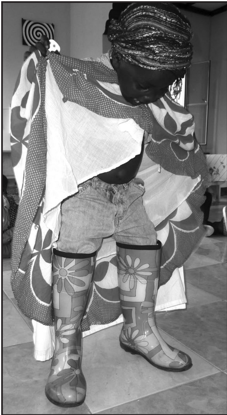
Subjects & Predicates

label themselves as a boy or girl, their preferences for gender-typed play activities and materials begins (Freeman, 2007). This demonstrates the link between play and gender identity formation.